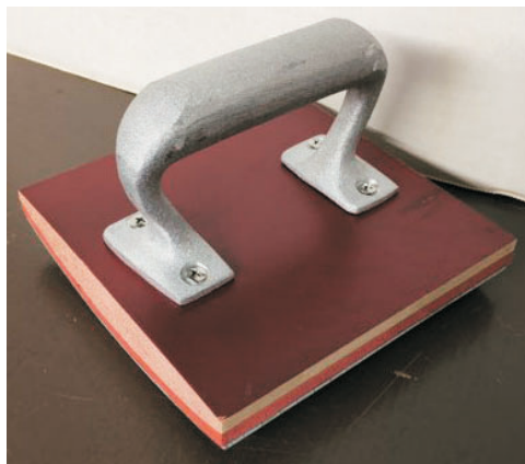
Photo 4, a rocker stamp with a ribbed cushion to accommodated changeable RIBtype® dies.

Photo 3 is not a rocker stamp but a peg stamp with curve text design to be stamped on a flat surface within a restricted space on a gear.